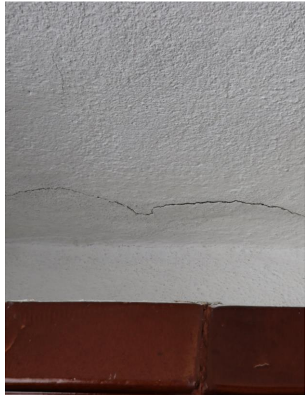
Cracks have appeared in recent years in residents' homes close to the road, both on building exteriors and along the walls and ceilings of interior rooms.

Impacts from MHP's heavy road use were foreseeable. In fact, MHP acknowledged them in meetings with community members in Olyanytsya in 2010. 102 Local residents have made numerous appeals for the immediate construction of the bypass road and other measures to address road impacts, dating back to 2012 or earlier. 103 In one such letter, community members in Olyanytsya again raised concerns about road impacts and presented a series of demands to MHP to address the issue, including construction of a bypass road, major road repairs, construction of sidewalks, speed limits, and an agreement not to construct any new brigades on Olyanytsya lands until these measures are carried out. 104 The Company and local officials agreed to implement all of the requested actions, 105 but to date, we have not seen any real progress.