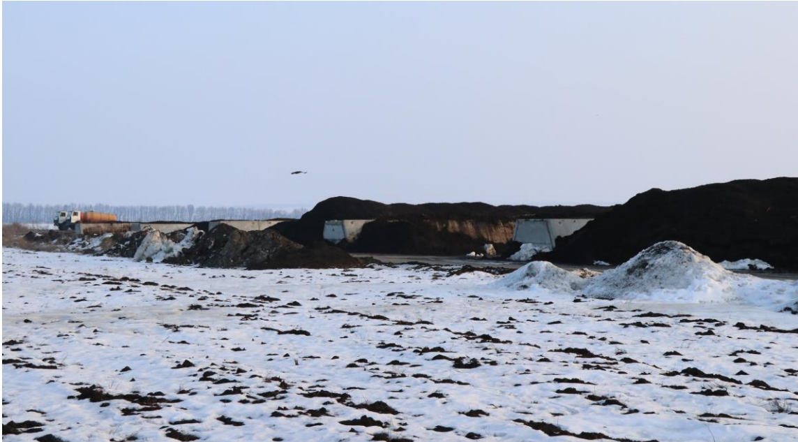
Chicken excrement lays uncovered in a manure storage facility.

trip in 2015, and recorded in the Black Earth report, published by CEE Bankwatch Network following that mission. 124