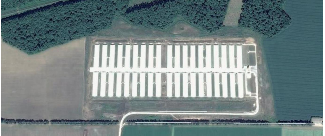
The typical brigade layout. Each brigade requires a total area of 25-30 hectares of land.