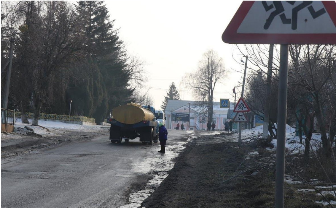
Large vehicles frequently utilize village roads creating risks to pedestrian safety and damage to physical property.

These impacts were particularly severe during construction, when heavy machinery traveled through the main road regularly. However, even after Phase 1 construction ended, heavy vehicles have continued to use the main road through Olyanytsya. In November 2017, we installed a video recorder to collect footage of the Olyanytsya main road for a full 7-day period. The footage shows an average of 400 MHP-related heavy vehicles traveling on the road each day, which accounted for approximately 70% of heavy vehicle traffic during the recorded period. 101