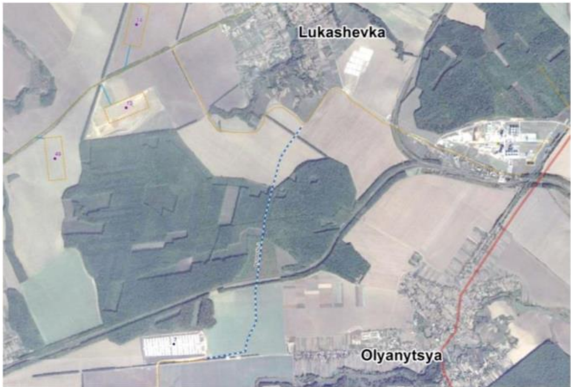
The planned Olyanytsya bypass is indicated by the blue dotted line.

In early 2015, as MHP was negotiating loans for the VPF expansion with the EIB, 106 and the EBRD, the Company developed a draft plan for a bypass road, but then progress stalled. 107 Construction has been delayed time and again for various reasons, despite continuing promises that it will be completed soon. 108 Meanwhile, the Company's construction of VPF Phase 2 facilities has continued on time. We interpret this as a prioritization of MHP's profit-making operations over the interests and wellbeing of local communities.