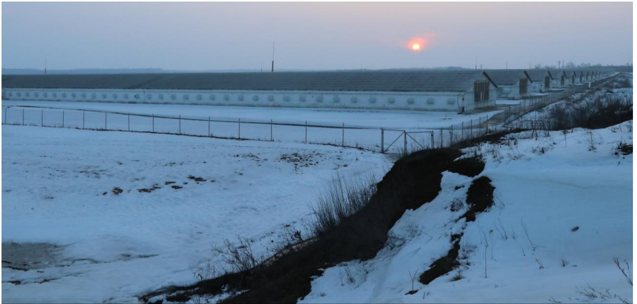
Existing poultry houses within the VPF.

The “overall project area” of Phases 1 and 2 of the VPF will use an estimated 27,000 hectares of land in the Vinnytsia Oblast between and surrounding our communities. 19