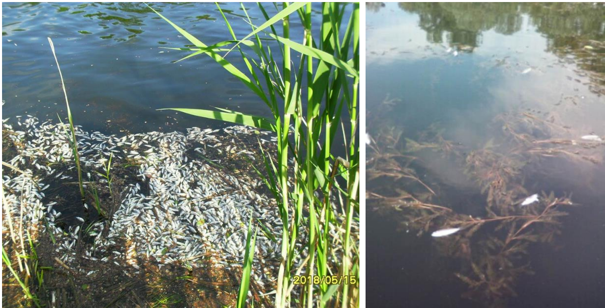
Community members reported seeing dead fish floating in the river near the outflow pipe of the wastewater treatment.

about 10 meters from her land and without prior notice to her. 132 Recently, on 4 May 2018, the same community member again noticed Zernoproduct Farm spraying pesticides close to her residence and without prior notice. This recent incident was again raised through a phone call to MHP’s Corporate Social Responsibility team, and after that the spraying did eventually stop, but we fear such incidents may continue to occur. Community members fear that spraying of pesticides may lead to potential pollution of soil and groundwater, as well as unknown health impacts for local residents. Disposal of treated wastewater in the Pivdenny Bug River raises similar concerns. 133 For example, in May 2018 local community members noticed dead fish floating in the river near the outflow pipe of the wastewater treatment plant and we fear that this may have been related to the Company’s operations. 134