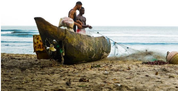
Fishermen inspect their net, Kribi, 2019.

In an effort to support the fishermen's livelihoods, the parties agreed to facilitate access for all fishermen associated with the cooperative into secure maritime zones rich in fish. Boats have all been painted the same blue color, and identification badges for cooperative members and license plates for the boats have been produced. Materials, including paint and badge-making equipment, have been handed over to the cooperative.