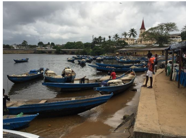
Local fishing boats in Kribi have been painted blue to indicate they are authorized to fish around the off-shore facility.

The mediation process resulted in several enhancements to the fishing communities' capacity to catch, store, and market fish, by rehabilitating and strengthening the existing fishing development association and transforming it into a cooperative.