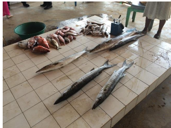
Fish being sold at a local market run by the cooperative.

Building on the results of the study, the fishermen provided COTCO with a list of the material required to strengthen the cooperative. COTCO then provided the cooperative with materials to stock their shop.