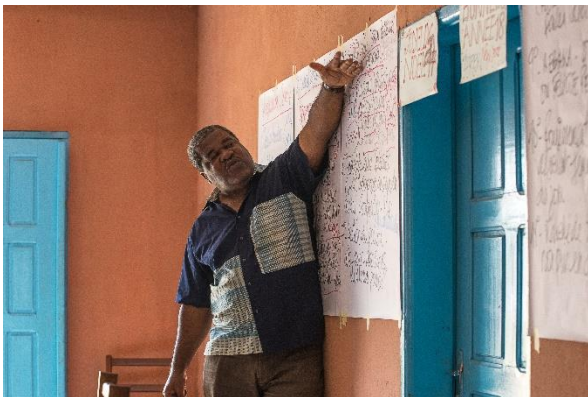
CAO worked with the Ebaka community to help build their capacity.

CAO remained engaged with the parties after the agreement was reached, to support them in the implementation of their agreement. During this time, internal conflicts between leaders of the committee have posed a challenge to the implementation of the agreement. CAO stayed engaged and helped to facilitate dialogue between leaders in search of a solution.