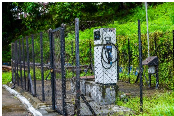
A pumping station is ready and available to the cooperative, once a contract has been signed with a fuel provider.

In mediation, the parties have full control over their final agreement. While the mediator plays an important role asking questions to help the parties test the agreement's robustness and likelihood of success, it is ultimately the parties' decision what to agree on. Once an agreement is reached, its implementation is again in the parties' hands, and a mediator's role is normally limited to that of a facilitator between the parties.