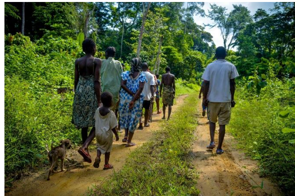
Bagyeli live near the pipeline route. Photo: Rodrig Mbock, 2019.

In May 2011, NGOs representing the Bagyeli indigenous communities filed a complaint with CAO claiming that the laying of the oil pipeline, which runs along territories of the Bagyeli, led to displacement and loss of livelihood among the Bagyeli indigenous communities residing in the Lolodorf, Bipindi, and Kribi territories.