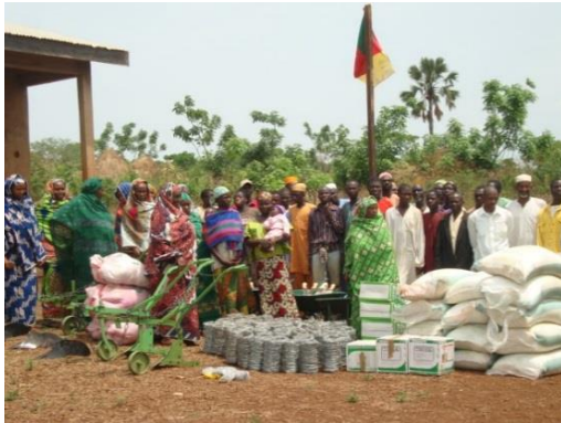
Members of the Djertou community receive agricultural products from the company.

After several meetings, the parties agreed to develop and implement an agricultural project as a form of compensation. COTCO provided equipment and material, which the community used to develop approximately four hectares of agricultural land.