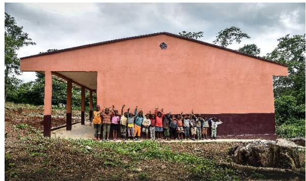
The Ebaka school receives a new building as part of the partnership agreement.

In their final partnership agreement , signed in July 2017, COTCO and the community of Ebaka identified community priority sectors that COTCO will support through specific development projects, aimed at improving the living conditions of the Ebaka residents.