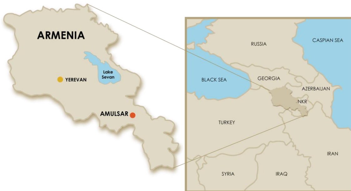
Map 4.1. Project Location

As shown in Map 4.1, the Amulsar project is located 170km south of Armenia's capital Yerevan on the border between the provinces (Marz) of Vayots Dzor and Sunnik. The Amulsar licenses cover a total of 65km 2 . Lydian Armenia has been carrying out geological exploration in the Amulsar area since 2006. 17